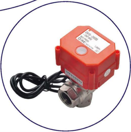
Electromagnetic reversing valve

Pressure monitoring & control Temperature monitoring & control