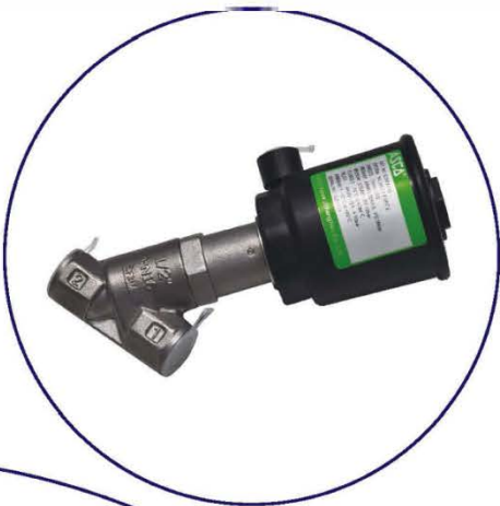
Pneumatic angle seat valve

Stainless steel structure Anti-bacterial surface Water saving system