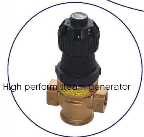
High perform steam generator